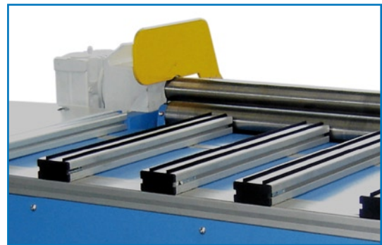
Fig: Tube ejector, pneumatically